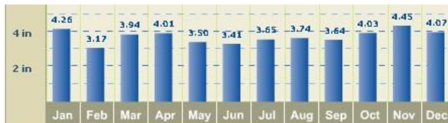
Hopkinton, MA (01748) Weather Facts (precipitation per month)

- The Landscape Committee and our landscape contractor request residents to please not park cars so far forward that cars overhang the lawn . This causes several problems. First, the heat given off by the engine burns the grass. Second, overhanging cars interfere with sprinkler heads, many of which